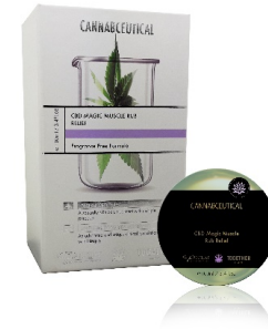
CBD Magic Muscle Rub Relief