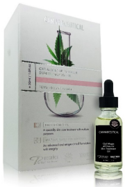
CBD Magic Skin Oil

The Dead Sea Premier Cosmetics Laboratories was established in 1990 by a group of experts in dermatology and cosmetics with years of experience and knowledge in the unique components of the Dead Sea. The Dead Sea Premier Cosmetics Laboratories is a major manufacturer of high quality Dead Sea cosmetic products. The Dead Sea Premier Cosmetics Laboratories Award winning, patented products have been recognized around the world for their effectiveness and innovation. Premier is an international company with sales in Canada, United States, UK, Argentina, Brazil, Japan, Hong Kong, Singapore, Chile, Panama, Dominican Republic, Peru, Portugal, Spain, France, Montenegro, Cyprus, Greece, Malta, The Netherlands, Belgium, Austria, Norway, Finland, South Africa, Botswana, Switzerland, Ukraine, India and more.