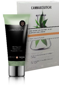
CBD Magic Skin Cream